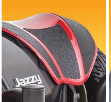
JAZZY ARMOR<sup>®</sup> AND COLOR-THROUGH SHROUD