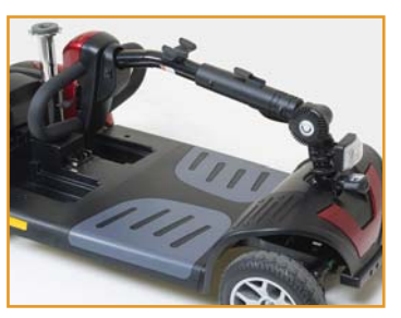
Step 3: Fold down tiller and lock in place!