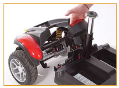
Step 4: Pull forward on the drivetrain release lever to separate the front and rear frame sections!