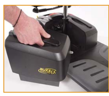
Step 2: Pull out the battery pack!