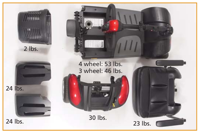
Disassembles into 6 pieces!