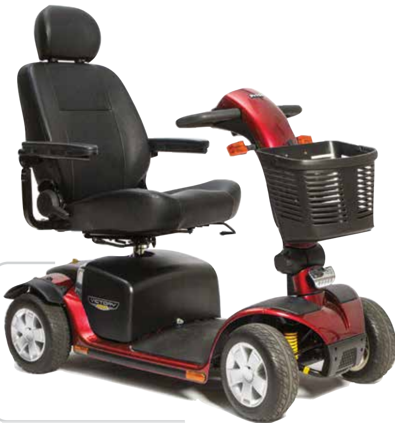
Candy Apple Red

The Victory ® Sport incorporates a sporty design with extra comfort and performance features for a truly unique ride experience. With a maximum speed of 8 mph — the fastest within the Victory Series — this scooter will accelerate your active lifestyle. Standard features include feather touch disassembly, wraparound delta tiller, 10" solid tires, front and rear suspension, high-back reclining seat, directional signals, a high-intensity LED lighting package, backlit battery gauge and a front basket. Available in Viper Blue and Candy Apple Red.